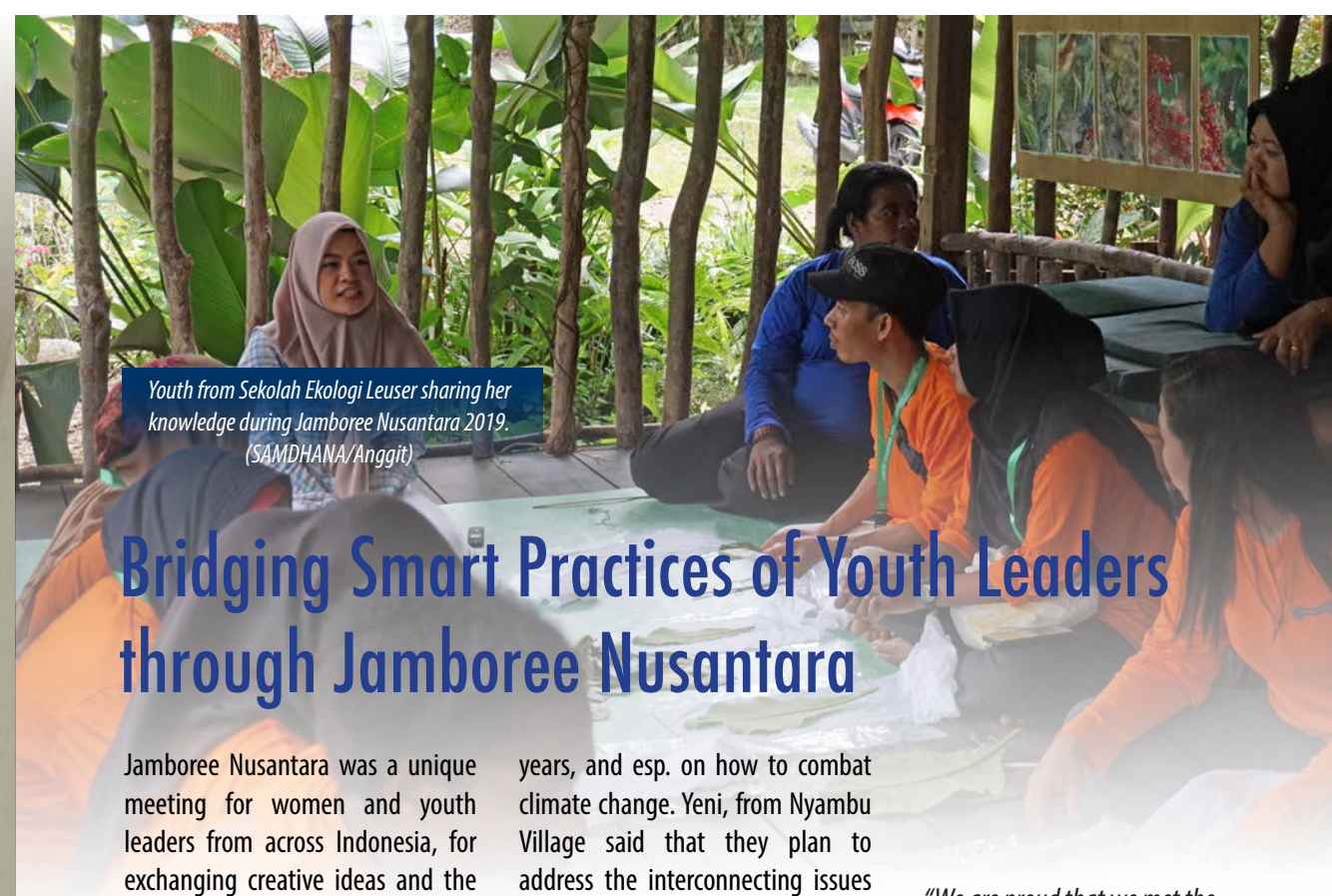
Youth from Sekolah Ekologi Leuser sharing her knowledge during Jamboree Nusantara 2019.