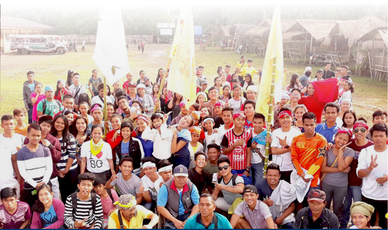
More than 120 Indigenous youth from different Higaonon ancestral domains joined the Indigenous Youth Eco-Cultural Camp in Cagayan de Oro, Philippines.