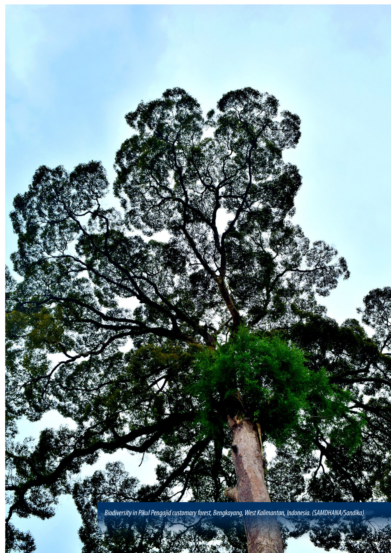
Biodiversity in Pikul Pengajid customary forest, Bengkayang, West Kalimantan, Indonesia.