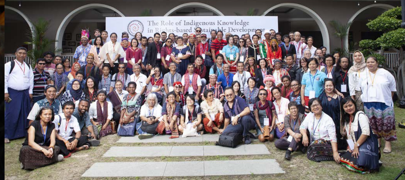
Participants of the Southeast Asia Regional Forum on the Role of Indigenous Knowledge in Rights-based Sustainable Development