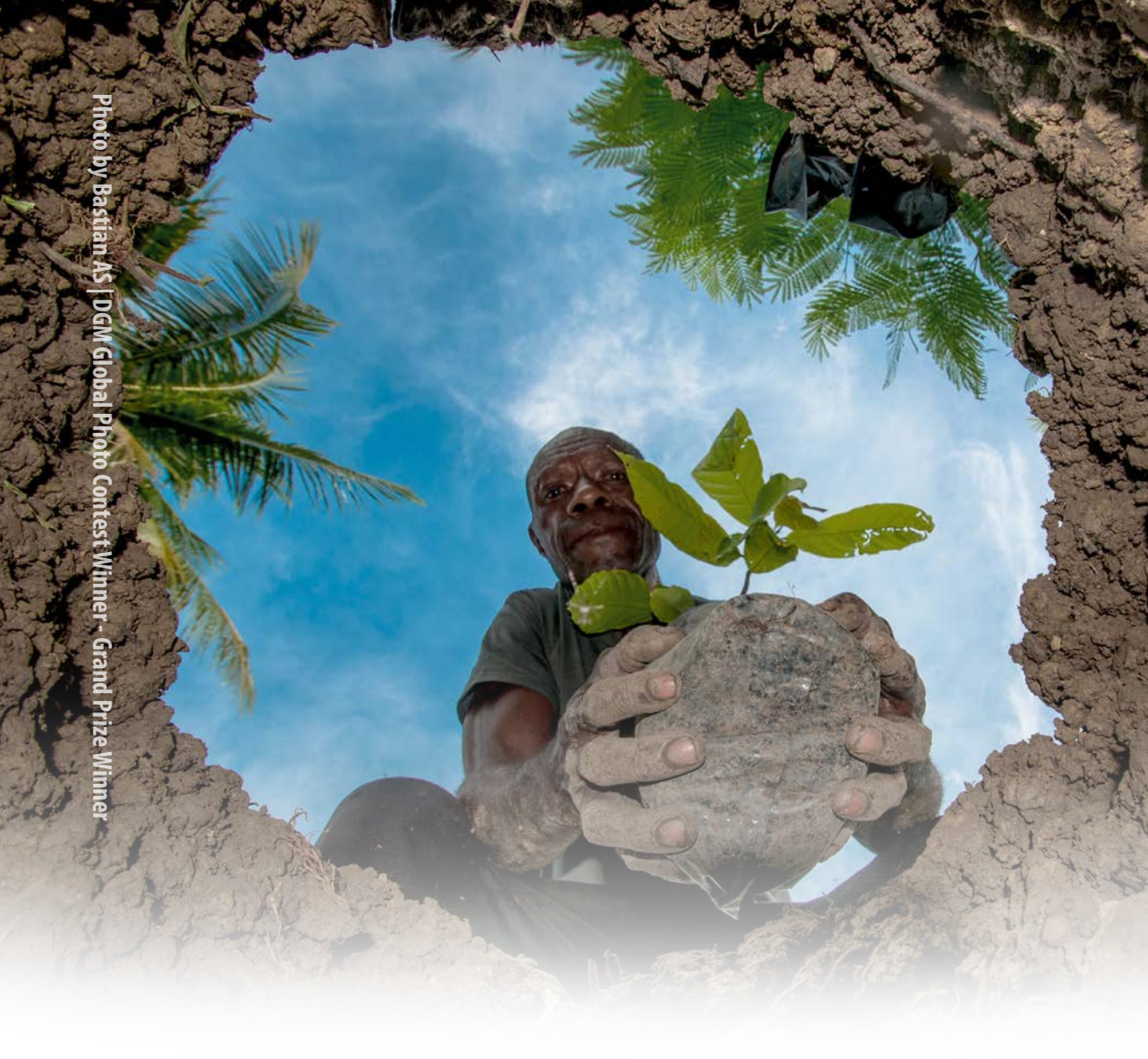
DGM Global Photo Contest Winner - Grand Prize Winner

INDONESIA, Jalan Tampomas No. 33, Bogor 16128 Jawa Barat, Phone +62 251 7546173